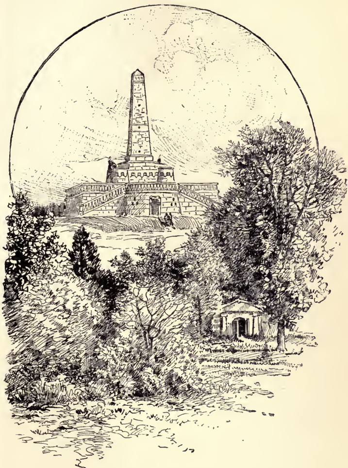
THE LINCOLN MONUMENT, SPRINGFIELD, ILL.